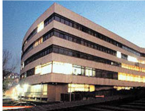
Joint Institutions' building, Sarajevo

Tel/Fax: +387 33 710 530 e-mail: ureddk@bih.net.ba